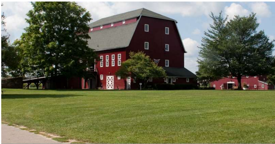
One of the beautiful buildings on the museum campus that contain some of the most beautiful automobiles from history. Bring your E-M-F related car to the Gilmore Museum grounds in July of 2023 and join us for the fun!