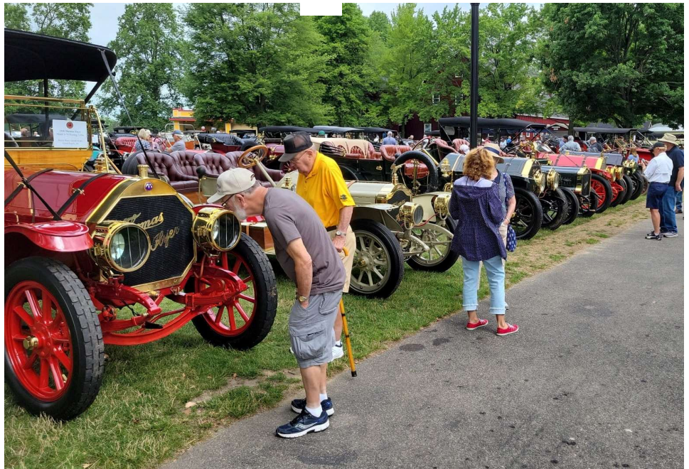
The lineup of 12 Thomas Flyers at the 2022 Celebration of Brass at the Gilmore car Museum. 2022 featured the Thomas Flyer. How about we E-M-F related marquee owners show them how it is done in 2023? Plan now to join us in 2023.

NOTE: New day due to Hershey schedule change!