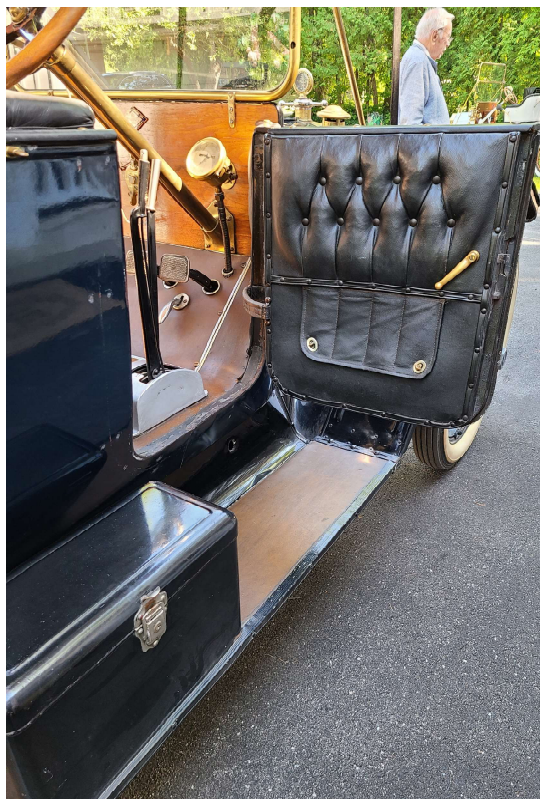
Driver controls and the beautiful upholstery on the doors.