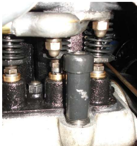
Picture showing the crankcase breather pipe. Oil should be checked at both breather pipes.